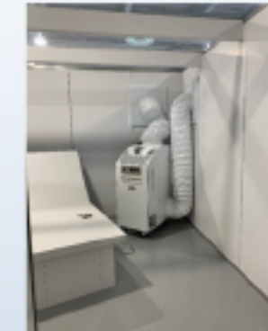
Figure 7: Room After Installation for Positive Pressure

In the positive pressure test, equilibrium was reached at virtually zero percent of the initial particle count. The initial count for particles 0.3 µm and larger was 372890 particles, and this number dropped to virtually 0 at equilibrium. An equilibrium pressure of 0.02" was reached within minutes. There is a subtle spike in particle count when the tester entered the room at 30 minutes, but the count quickly drops back off to just above zero percent of the initial count when the tester leaves the room and closes the door. Figure 8 shows the particle counts over the 65-minute positive pressure test as both a percentage of the initial particle count and the total number of particles over time.