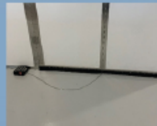
Figure 4: Pressure Sensor Setup

A 65-minute test was performed for both negative and positive pressure conditions. During each test, sixty 1-minute particle count samples were taken with a hold of 5 seconds between each sample. Pressure was measured about 5 minutes into the test to make sure a sufficient delta with the surrounding space was reached. At 30 minutes, the tester entered the room check the system, while also providing a rough simulation of a person entering the patient's room.