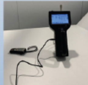
Figure 3: Particle Counter

An AirData™ Multimeter ADM-860 was used to prove a sufficient pressure delta between the isolation space and surrounding area was created after several minutes of IsolationAir® unit operation. Initially, the room was not sealed well enough to create a sufficient gradient, so duct tape was used to seal off large gaps between sections or the corrugated paper walls. For negative pressure operation, the goal was to create a minimum of 0.03" pressure gradient between the inside and outside of the space. For positive pressure, the goal was to create at least a 0.01" gradient. The pressure sensor setup is shown in Figure 6.