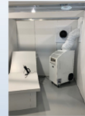
Figure 5: Room After Installation for Negative Pressure

In the negative pressure test, an equilibrium was reached at around 35 percent of the initial particle count after 5 minutes of operation. The initial count for particles 0.3 µm and larger was 372650 particles, and the equilibrium number was approximately 128000 particles. An equilibrium pressure of 0.030" was reached around the same time, which well exceeds the CDC guidelines. There is a clear spike in particle count when the tester briefly entered the room at the 30-minute mark. Soon after the tester left, a new equilibrium was quickly reached at around 45 percent of the initial particle count. The increased number of particles in the second equilibrium may be explained by a leakage formed around the time the tester entered the room. After the test it was noticed that the grill adapter had pulled away from the wall, creating a gap that allowed more dirty air to flow into the room. It is also possible that the door was not sealed quite as tight after the tester exited the room, further explaining the new equilibrium value. Regardless, a significant decrease in particle count was still observed. Figure 6 shows the particle counts over the 65-minute negative pressure test as both a percentage of the initial particle count and the total number of particles over time.